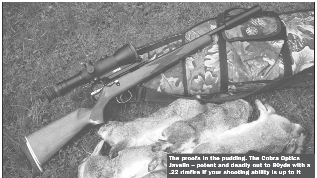
The proofs in the pudding. The Cobra Optics Javelin – potent and deadly out to 80yds with a .22 rimfire if your shooting ability is up to it

The unit has multi-coated lenses and the body casing is manufactured from high impact synthetic materials. This is fully weatherproof and lightweight, and due to clever internal design characteristics it can withstand recoil from larger calibre rifles. The casing is unusual as it isn't metal, but this is no cause for concern as it more than stood up to the beating I've given it during test.