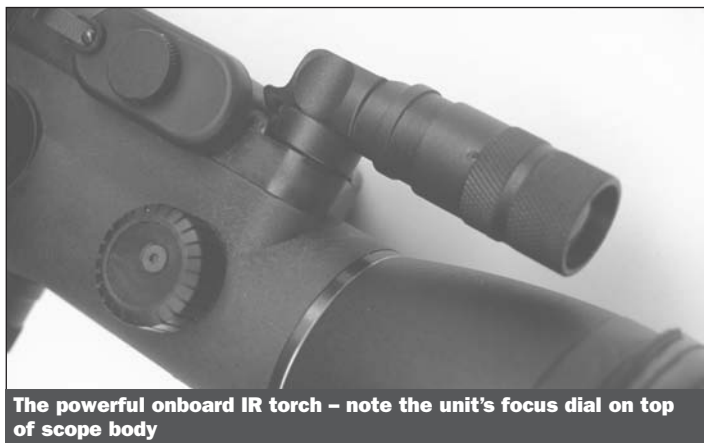
The powerful onboard IR torch – note the unit's focus dial on top of scope body

The scope's 100mm objective lens is a good size for light gathering yet being a nice compromise so as the scope needn't be mounted too high from the bore of the rifle. The eyepiece makes up the majority of the rearward section of the scope but