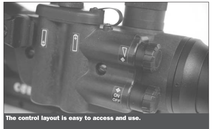
The control layout is easy to access and use.