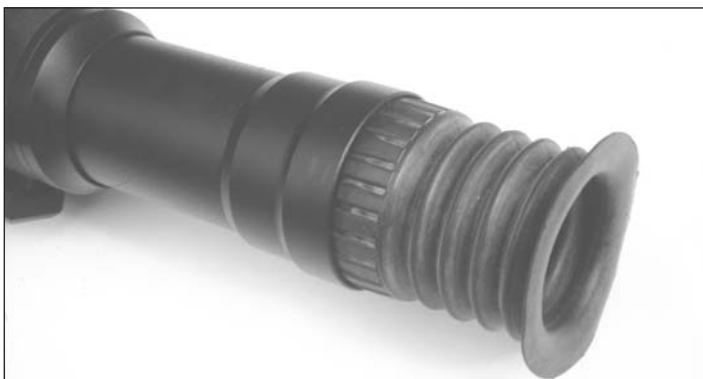
The long eyepiece and rubber eyecup showing ocular adjuster