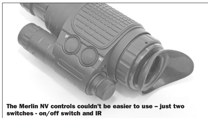
The Merlin NV controls couldn't be easier to use – just two switches – on/off switch and IR

The Merlin comes in different 'generations'; Gen 1 (Merlin) and Gen 2 (Cyclone) and they are priced accordingly. Though I've given the Merlin a full testing, I'm currently putting the Cyclone Gen 2 through its paces on a rimfire and getting to grips with it on a .222REM to see just how fox capable that particular model is, but here we're looking at the base unit, the Gen 1 model Merlin. This is a capable unit for rat and rabbit shooting at sensible ranges, when fitted to a suitable 12ft/lbs air rifle/scope combo. It comes with adapter rings, ring blinds and the monocular itself. All is straightforward in terms of fitting, and a comprehensive booklet is included to show you how, but using it does take some getting used to, as quite frankly