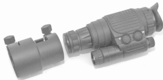
The Merlin Gen1 NV Monocular kit consists of monocular, scope adaptor and sizing rings – and all at a very affordable price